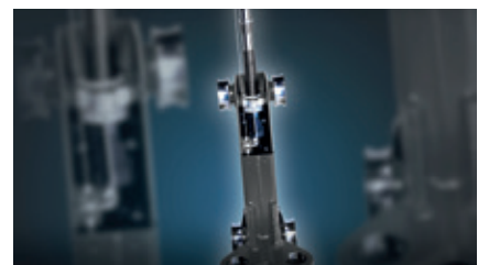
Carriage with rollers