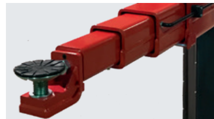
Triple telescopic arms with F-pad