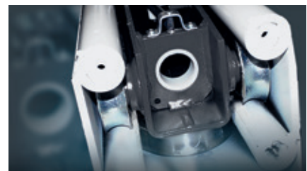
Stable, welded post