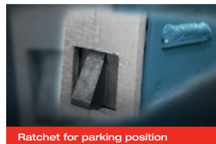
Ratchet for parking position