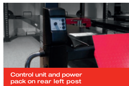
Control unit and power pack on rear left post