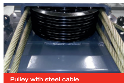
Pulley with steel cable